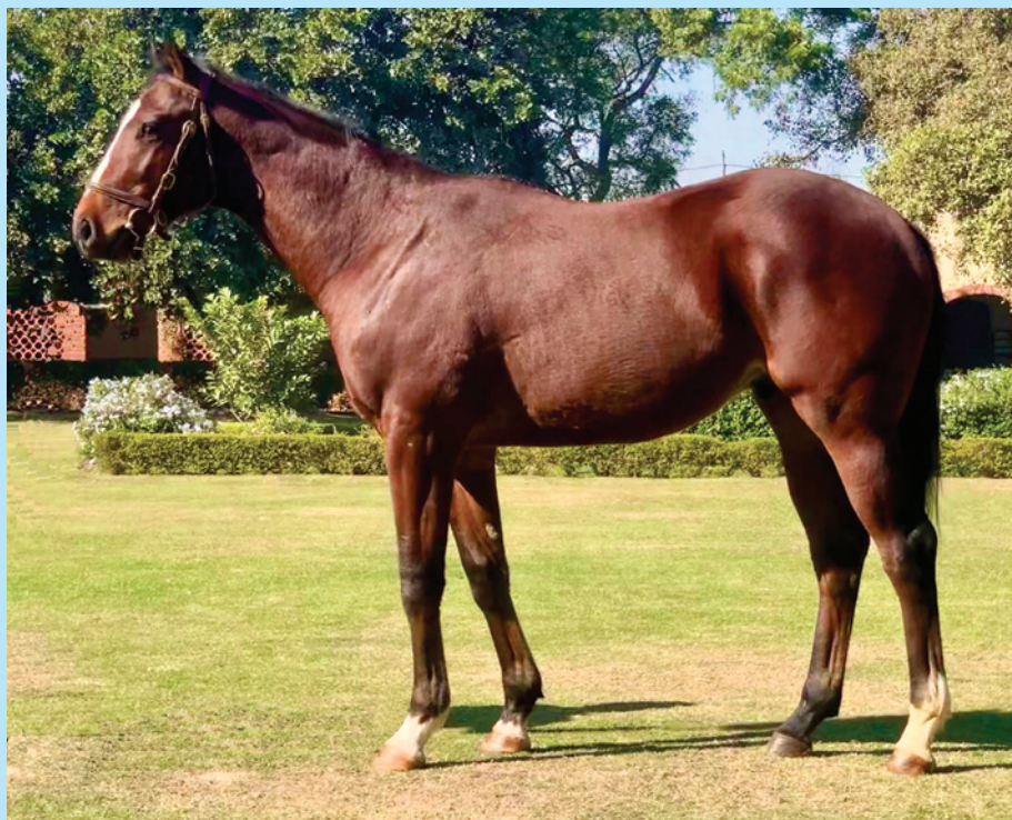
Lot No. 178, b c by Win Legend[JPN] ex Tijuca Forest