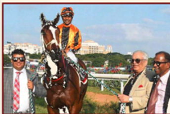
SIR SUPREMO b f 2016 out of Cool Mover