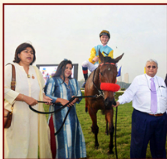
GIFT OF GRACE b f 2016 out of Appeasing