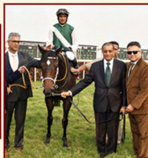
ROSINA b f 2016 out of Roses In Bloom