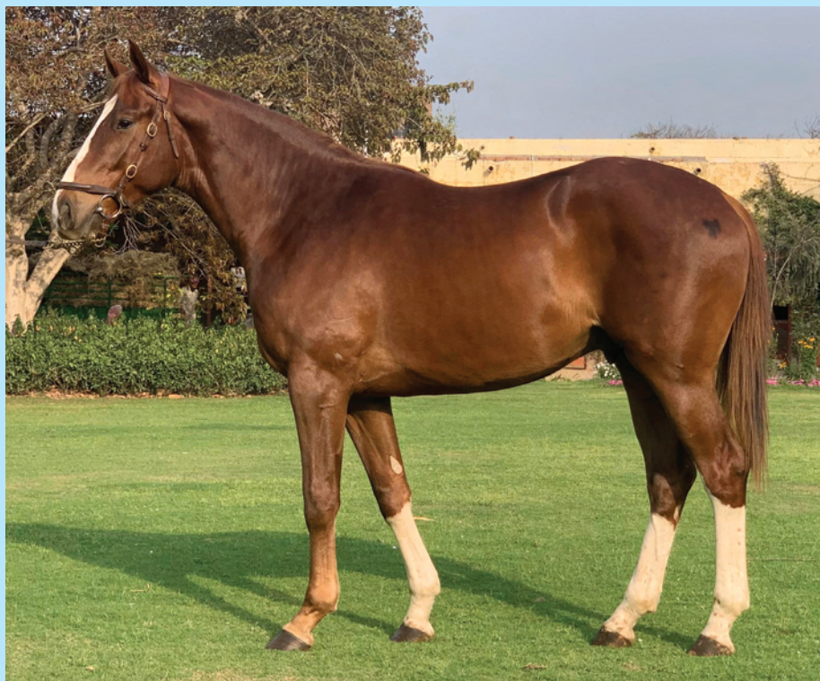
Lot No. 86, ch c by Win Legend[JPN] ex Woodberg